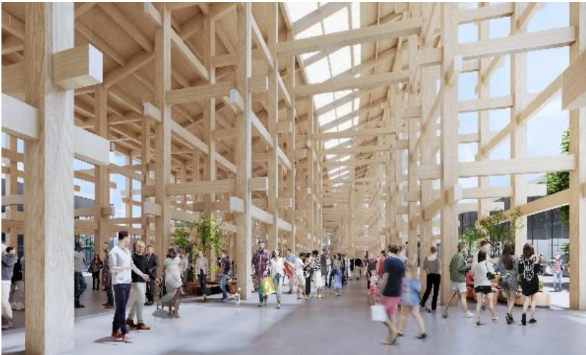
Interior 1 (Ring Ground Walk)